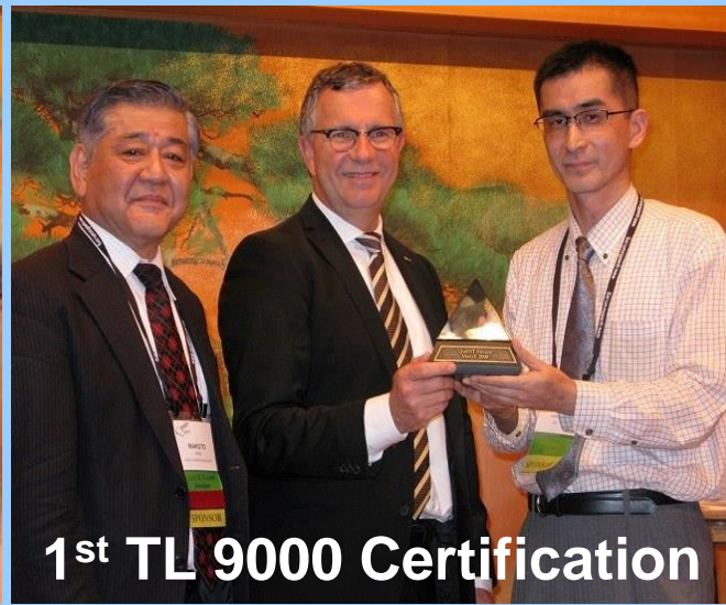
1 st TL 9000 Certification