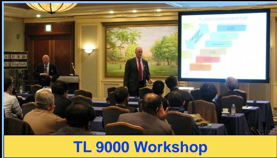
TL 9000 Workshop

TL 9000 Workshop with Simultaneous Translations